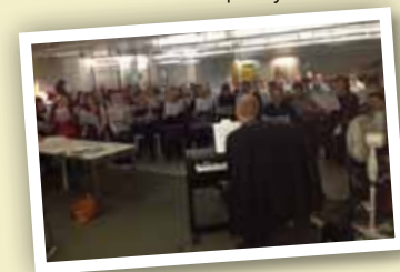
Into the Woods (left) and Heaven Can Wait both had more than 60 people at pre-audition workshops